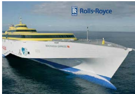
Fig. 10. Fast ferry with a Rolls-Royce propulsion system with gas turbines and waterjets [8]

Decision of applying gas turbines arises from a need of main engine mass limitation and a long term of exploitational work during manoeuvre conditions. Gas turbines allow on a quick start of power plant and achieve nominal loads in short time. Water-jets with deflected nozzles have a worse manoeuvre possibilities in comparison to azimuth and cycloidal thrusters – but are enough for an independently navigation even at small speeds.