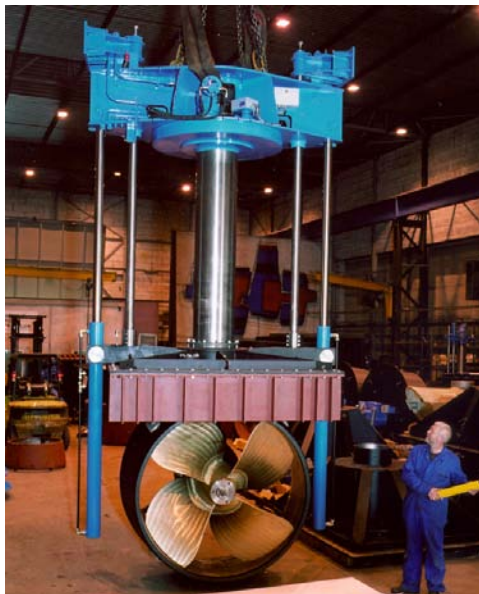
Fig.4. Retractable thruster as an emergency propulsion and bow thruster [7]

For typical merchant ships it was a proposition of unconventional thruster application with a possibility of thruster hiding inside the hull (retractable thrusters) as a better version of bow or stern thrusters (Fig.4), especially when they may fulfill function of emergency propulsion (on condition, that the ship speed would be minimum 55% of nominal ship speed when the main propulsion is efficient). The main disadvantage of that solution is a necessity of water margin under the vessel hull because of the thruster is outside and under the hull. During operations on shallow waters that thruster may be useless.