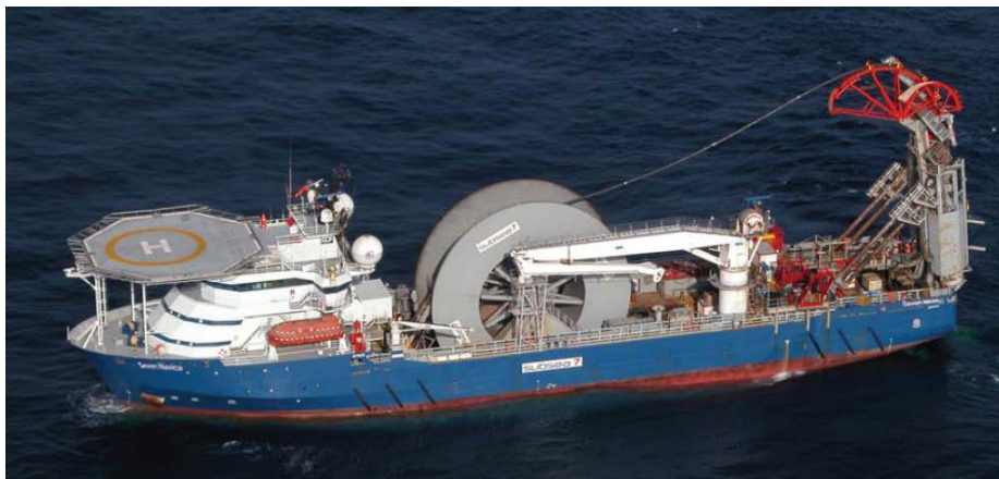
Fig. 9. Pipe-lay vessel „Seven Mavica”

The ship function is determined about a hull shape in the aim of locating the industry part. However the exploitative considerations and moving requirements (positioning) forced an application of unconventional propulsion with the ship's dynamic positioning systems [2,4].