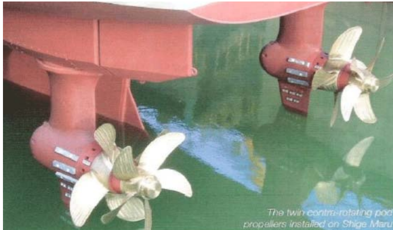
Fig. 6. The twin contra-rotating pod propellers installed on “Shige Maru” [6]