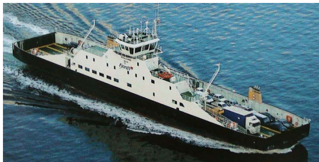
Fig.2. Double-ended ferry [9]