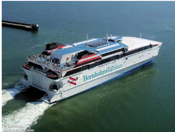
Fig.1. High speed craft Villum Clausen [11]

To unconventional thrusters are counting: thrusters Z-type (azimuth thrusters), cycloidal thrusters (Voith-Schneider Propeller VSP), waterjets, azipods, magneto-hydrodynamic thrusters. The main application of unconventional thrusters is main ship propulsion - it concerns specialist vessels (for example: tugs), mainly multi-mode ships with dynamic positioning systems (cable ships, pipe-lay vessels, drilling platforms), superfast ships (superfast catamarans (Fig.1), trimarans), double-ended ferries (Fig.2), some big cruise liners (for example: Queen Mary II).