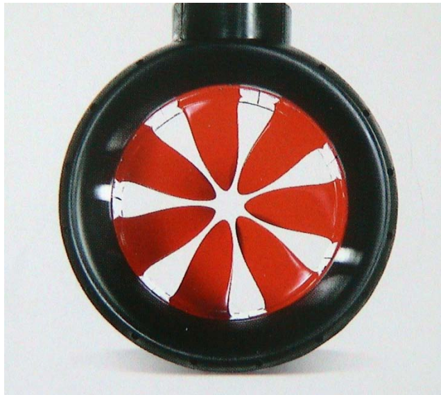
Fig.5. VSP inlet thruster (Schottel ESP thruster) [9]

Azipods are more and more applied (Fig.6, Fig.7) as main ship propulsion and prepared to work in ice areas as well. Sometimes the propulsive systems are very complicated and developed. The ship named „Ice Maiden I” was rebuilt in 2008 [3]. There were applied 8 azipods: at stern - 2 azimuth thrusters with 3MW power each constructed by Rolls-Royce Aquamaster, at midship - 4 azimuth thrusters with 2MW power each constructed by Rolls-Royce and at bow - 2 Rolls-Royce tunnel thrusters (retractable) with 1.42MW power each [3].