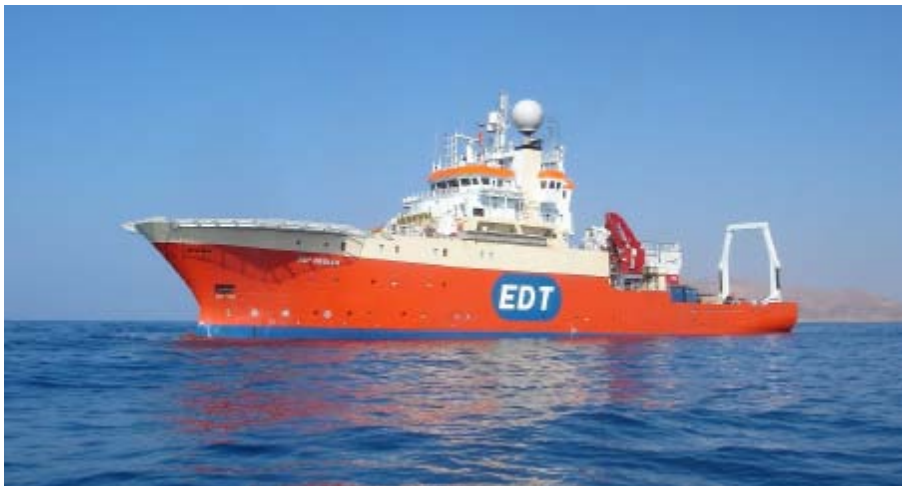
Fig. 11. EDT Protea [10]

A good example of change direction is a major conversion of EDT Protea as the ship with dynamic positioning system (DP III) (Fig.11). It was made in 2006 in Naval Shipyard at Gdynia (Poland). The main propulsion consists of two Schottel Azimuth Thrusters type SRP 2020 (each 2200 kW) and as the bow thrusters two Brunvoll Tunnel FU 80 LTC-2000 (each 1100 kW) and one Brunvoll Retractable Thruster of 880 kW power. The prime mover is diesel-electric (D-E) with four 2200 kW Royce-Rolls Bergen BRG-6 engines in two separate engine rooms.