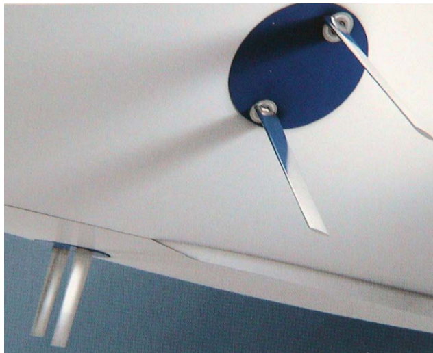
Fig.8. Voith-Schneider propellers as antiheeling device [9]

How specialized ships might be it was shown for example for pipe-lay vessel presented on Fig.9.