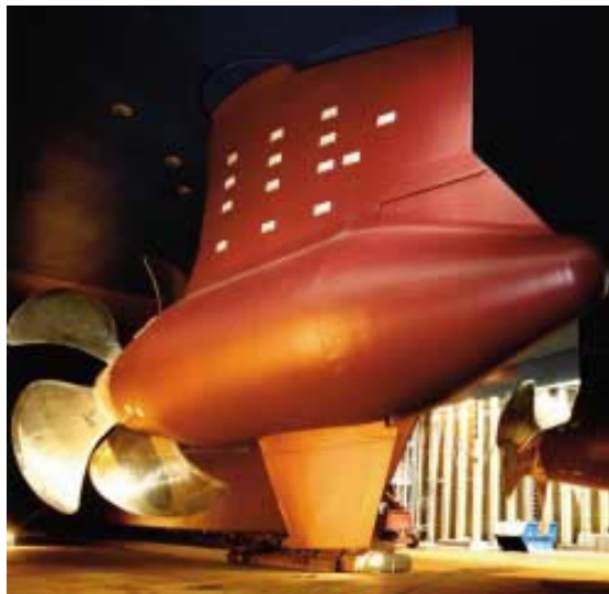
Fig. 7. Azipod propulsion 2*19.5 MW on mv Radiance of the Seas [1]

The unconventional thrusters are tried to apply as antiheeling devices (the function is a limitation the ship heels in bad weather conditions). This is essential significance for passenger ships (the comfort of voyage) or navy ships (ship safety, increasing the accuracy of positioning, decreasing the level of gravity loads). An example of antiheeling device is presented on Fig.8.