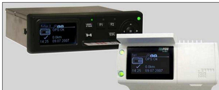
Fig. 3. OBU - TRIPON EU ( http://www.fela.ch/ ) (OBU presented and accepted in 12 November 2008 in Brussels in RCI frame)

the standards which will provide the definitions for the key interfaces 4, 5 and 6. These standards will be fully open and available.