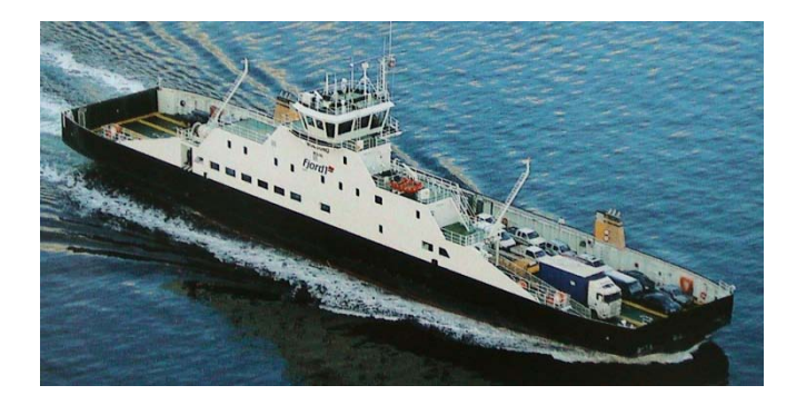
Fig.2. Double-ended ferry [9]