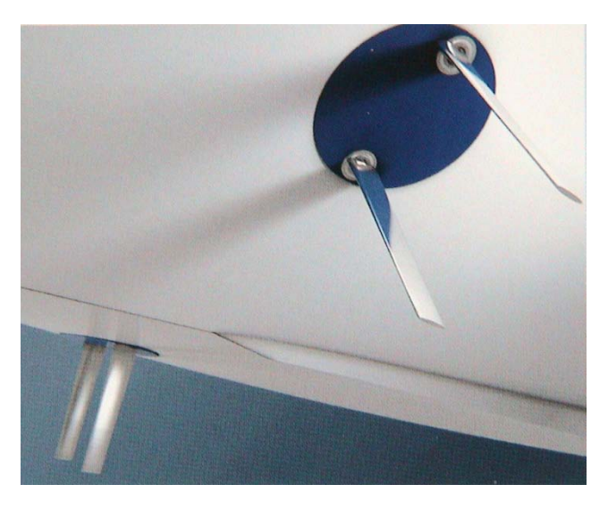
Fig.8. Voith-Schneider propellers as antiheeling device [9]

How specialized ships might be it was shown for example for pipe-lay vessel presented on Fig.9.