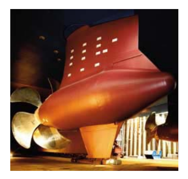
Fig. 7. Azipod propulsion 2*19.5 MW on mv Radiance of the Seas [1]

The unconventional thrusters are tried to apply as antiheeling devices (the function is a limitation the ship heels in bad weather conditions). This is essential significance for passenger ships (the comfort of voyage) or navy ships (ship safety, increasing the accuracy of positioning, decreasing the level of gravity loads). An example of antiheeling device is presented on Fig.8.