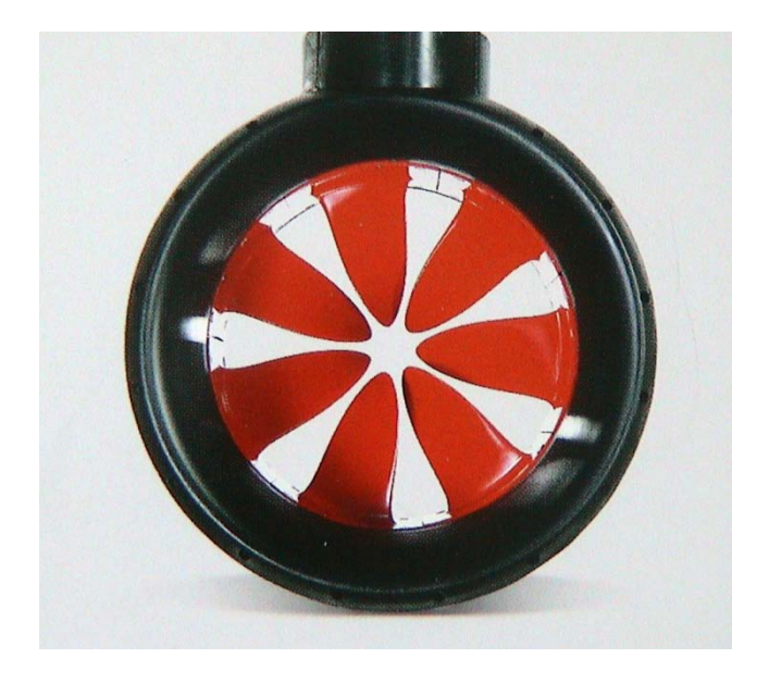
Fig.5. VSP inlet thruster (Schottel ESP thruster) [9]

Azipods are more and more applied (Fig.6, Fig.7) as main ship propulsion and prepared to work in ice areas as well. Sometimes the propulsive systems are very complicated and developed. The ship named "Ice Maiden I" was rebuilt in 2008 [3]. There were applied 8 azipods: at stern - 2 azimuth thrusters with 3MW power each constructed by Rolls-Royce Aquamaster, at midship - 4 azimuth thrusters with 2MW power each constructed by Rolls-Royce and at bow - 2 Rolls-Royce tunnel thrusters (rectractable) with 1.42MW power each [3].