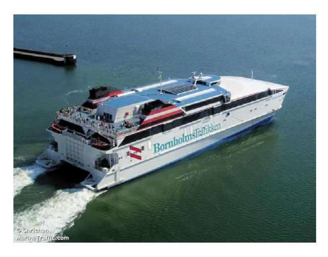
Fig.1. High speed craft Villum Clausen [11]

To unconventional thrusters are counting: thrusters Z-type (azimuth thrusters), cycloidal thrusters (Voith-Schneider Propeller VSP), waterjets, azipods, magneto-hydrodynamic thrusters. The main application of unconventional thrusters is main ship propulsion - it concerns specialist vessels (for example: tugs), mainly multi-mode ships with dynamic positioning systems (cable ships, pipe-lay vessels, drilling platforms), superfast ships (superfast catamarans (Fig.1), trimarans), double-ended ferries (Fig.2), some big cruise liners (for example: Queen Mary II).