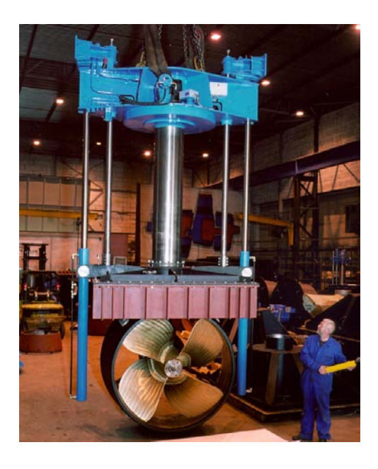
Fig.4. Rectractable thruster as an emergency propulsion and bow thruster [7]

For typical merchant ships it was a proposition of unconventional thruster application with a possibility of thruster hiding inside the hull (rectractable thrusters) as a better version of bow or stern thrusters (Fig.4), especially when they may fulfill function of emergency propulsion (on condition, that the ship speed would be minimum 55% of nominal ship speed when the main propulsion is efficient). The main disadvantage of that solution is a necessity of water margin under the vessel hull because of the thruster is outside and under the hull. During operations on shallow waters that thruster may be useless.