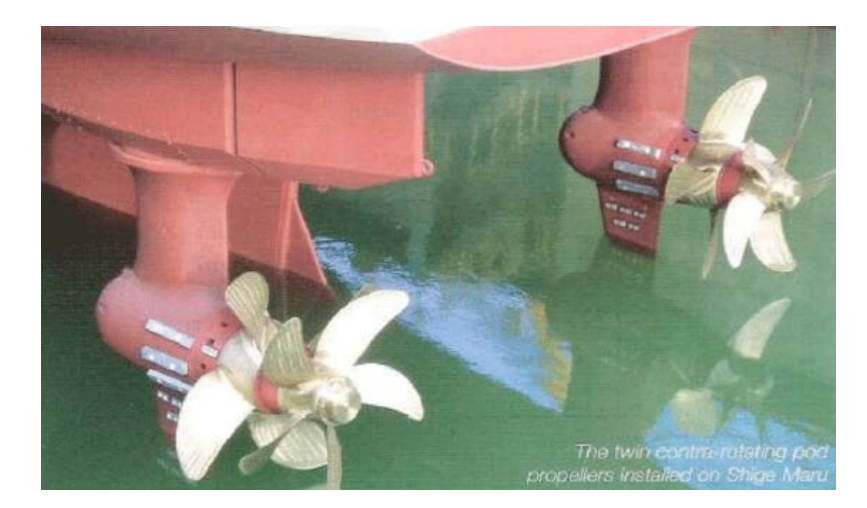
Fig. 6. The twin contra-rotating pod propellers installed on "Shige Maru" [6]