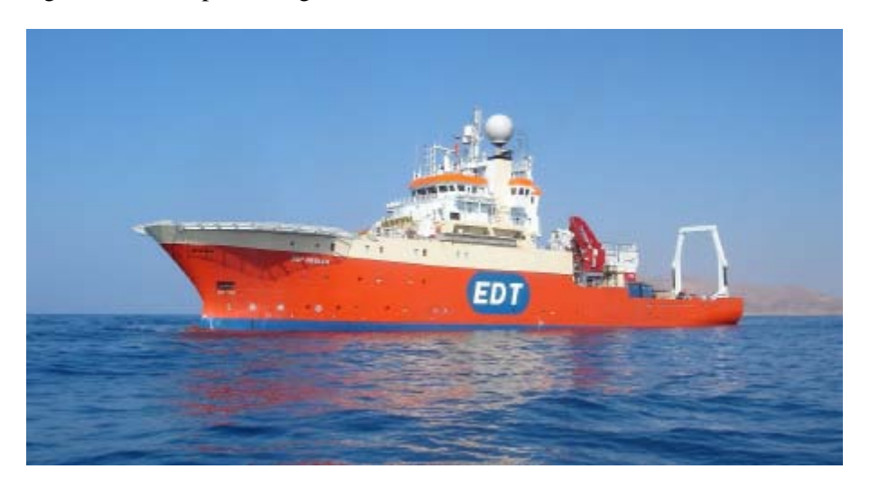
Fig. 11. EDT Protea [10]

A good example of change direction is a major conversion of EDT Protea as the ship with dynamic positioning system (DP III) (Fig.11). It was made in 2006 in Naval Shipyard at Gdynia (Poland). The main propulsion consists of two Schottel Azimuth Thrusters type SRP 2020 (each 2200 kW) and as the bow thrusters two Brunvoll Tunnel FU 80 LTC-2000 (each 1100 kW) and one Brunvoll Rectractable Thruster of 880 kW power. The prime mover is diesel-electric (D-E) with four 2200 kW Royce-Rolls Bergen BRG-6 engines in two separate engine rooms.