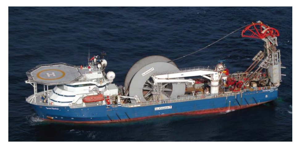
Fig. 9. Pipe-lay vessel "Seven Mavica"

The ship function is determined about a hull shape in the aim of locating the industry part. However the exploitational considerations and moving requirements (positioning) forced an application of unconventional propulsion with the ship's dynamic positioning systems [2,4].