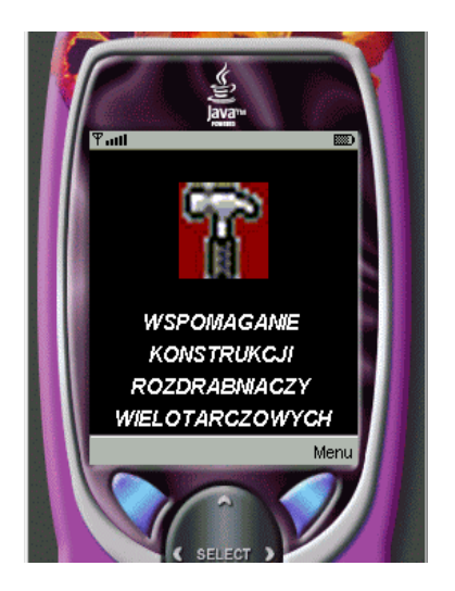
Fig. 1. Cell-phone start image with title of the progam computer (telephone) aided multi-disc grinders design CAD=TAD-IE