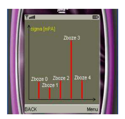
Fig. 3. Graphic representation of the research results and TAD-IE program data [3]

Here is a set of high level API classes set in the program, together with a short description and a part of source code: