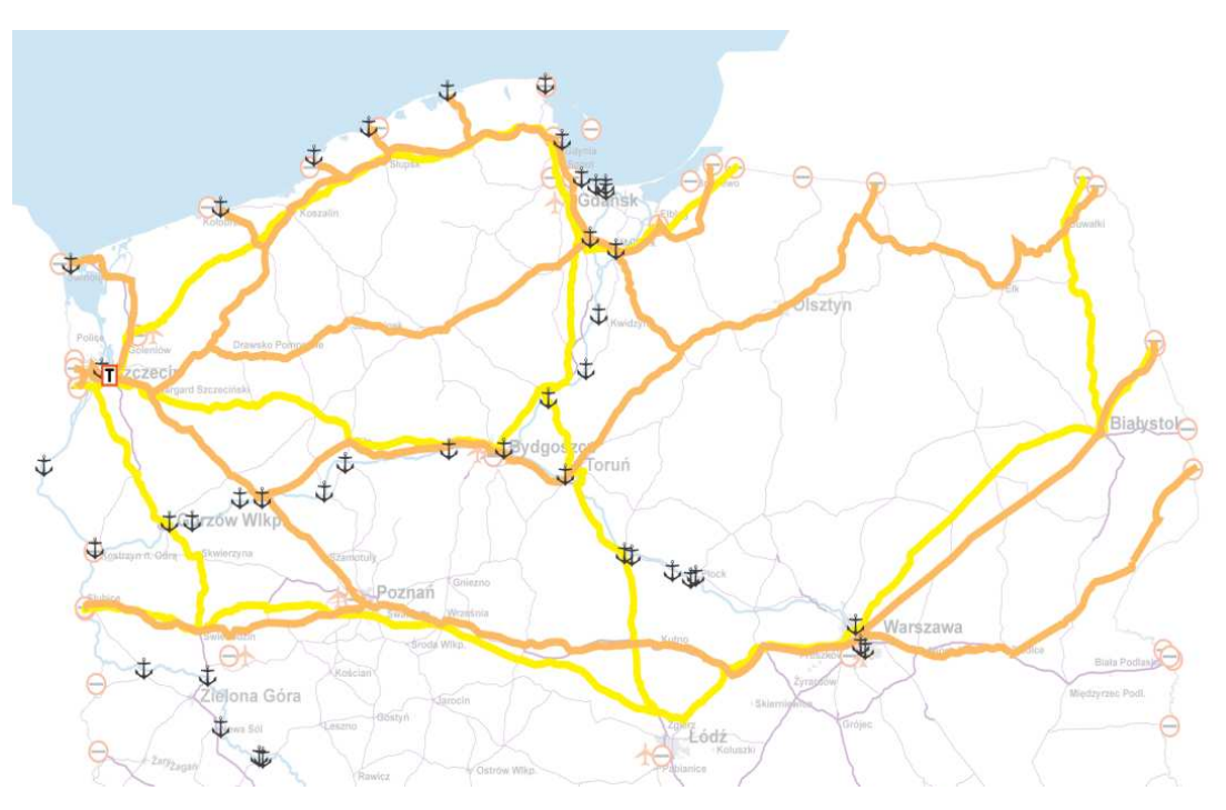
Fig. 4. Intermodal transport corridors for OC transport

OC transport corridors (Fig. 4) were determined by taking into account places where oversize goods are manufactured, places in Northern Poland to which such goods may be sent, the road, rail and waterway networks, potential points of transshipment to other modes of transport [8].