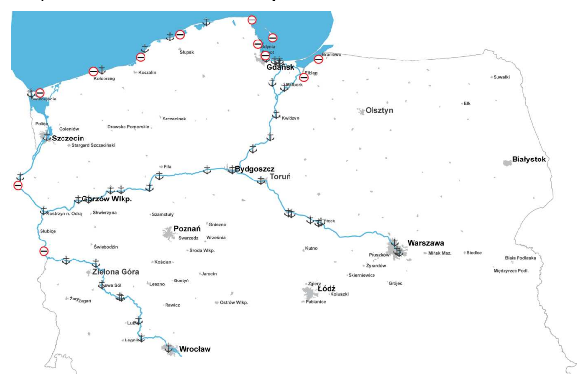
Fig. 1. Sea ports, inland shipping ports and waterways

There are many Polish inland ports (Fig. 1), but most of them have been closed due to poor condition of the Polish waterways.