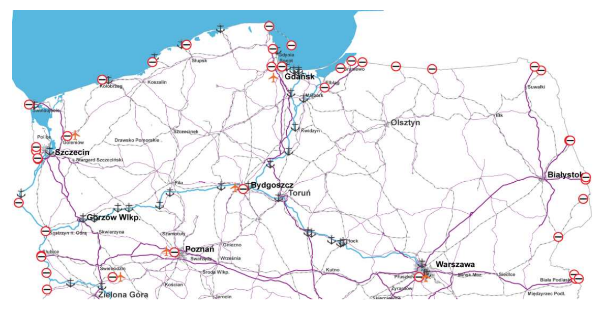
Fig. 3. Transport infrastructure adjusted to OC transport